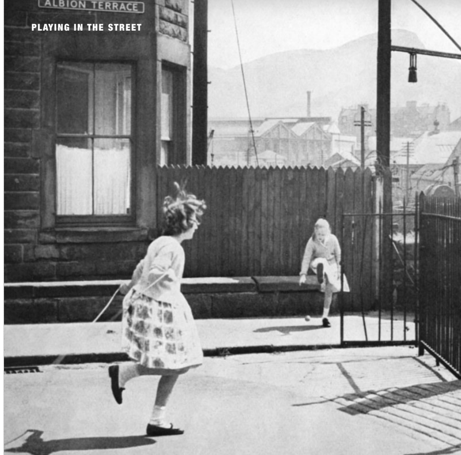
PLAYING IN THE STREET

“Charlie Chaplin went to France” was a widespread ball-bouncing and skipping chant. The two preceding lines are less usual. “Dummy, dummy shells” is puzzling — children in Fife in 1981 sang about two