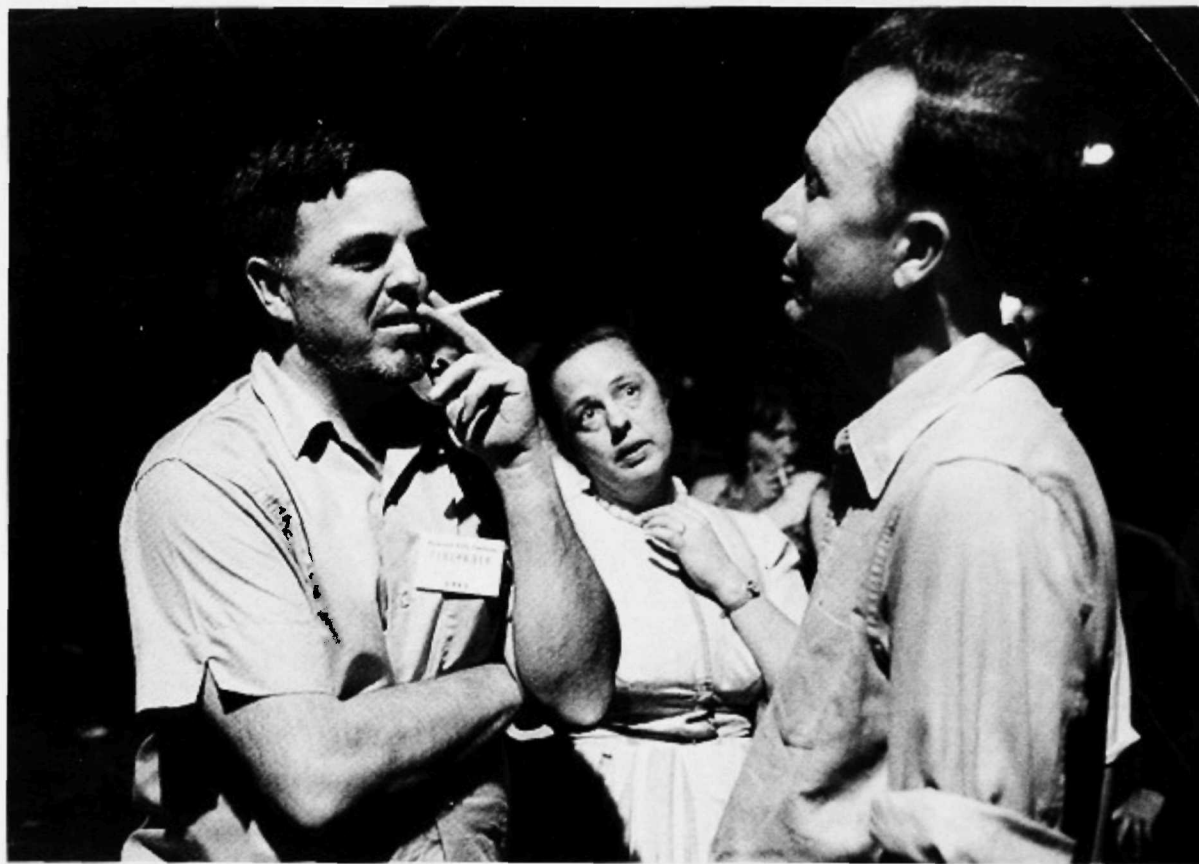
Fig. 3. Newport 1963—Alan Lomax, Bess Lomax Hawes, Pete Seeger at the 1963 Newport Folk Festival.