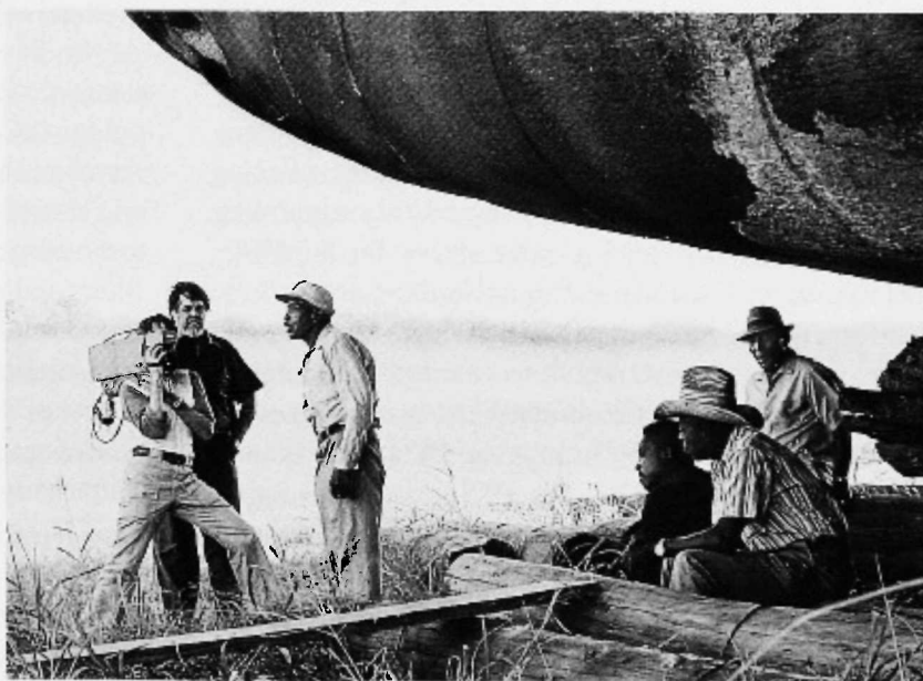
Fig. 5. Filming for The Land Where the Blues Began .

television station." Invariably this elicited snickers from the crew who knew the agency that employed them was