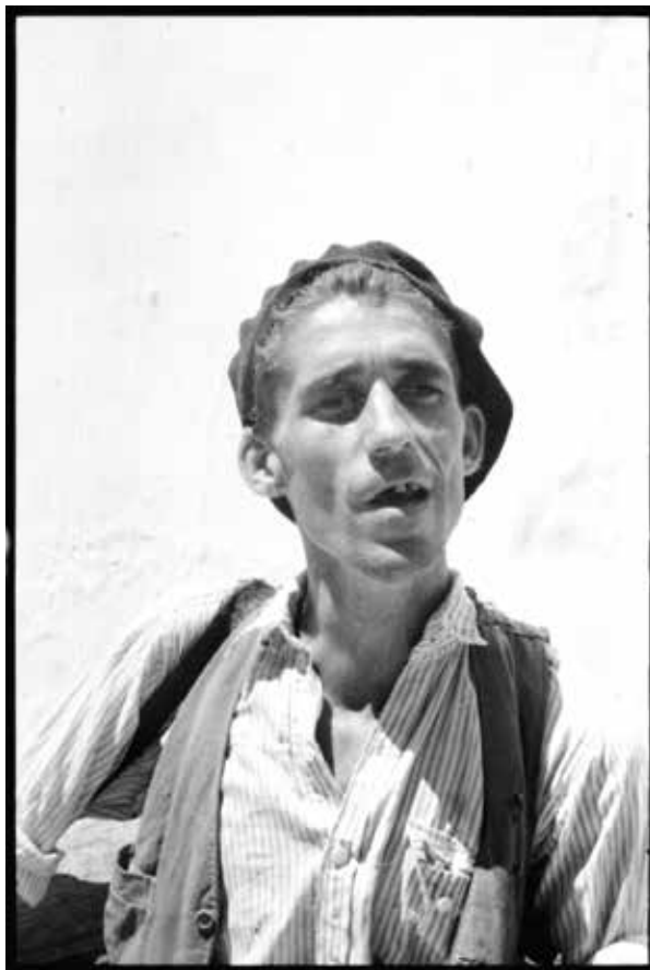
Unidentified street vendor (Vol. 5), Valencia City, Spain, August 1952.

Practical men often regard these expressive systems as doomed and valueless. Yet, wherever the principle of cultural