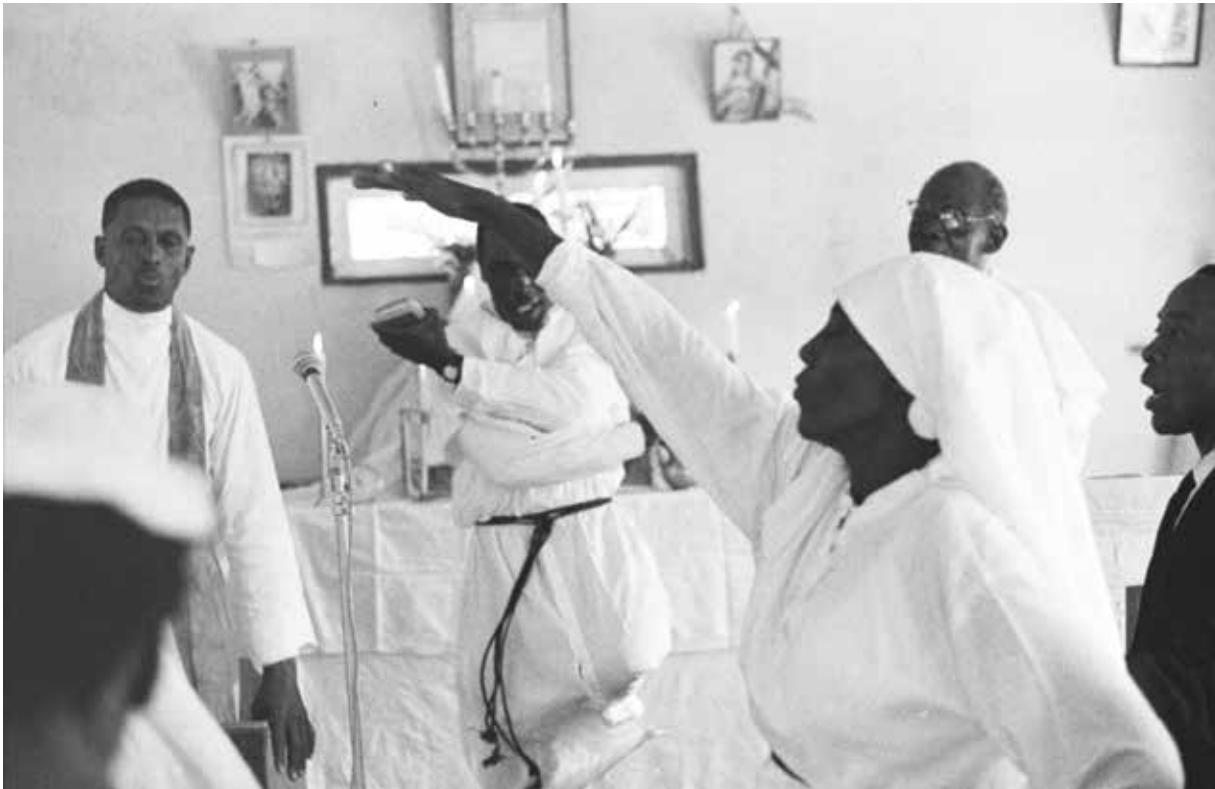
Spiritual Baptist service (Vol. 6), Syne Village, Trinidad, May 1962.

During most of man’s history contact between peoples did not usually mean that one culture swallowed up or destroyed another. Even in the days of classical empire, vassal states were generally permitted to continue in their own lifestyle, so long as they