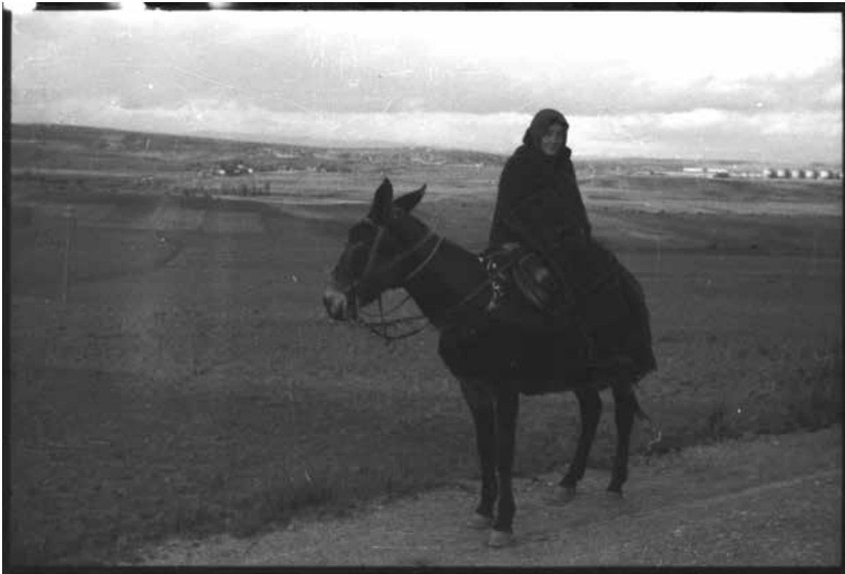
Woman and donkey, Val de San Lorenzo, Castilla y León, Spain, November 1952.

Any thoughtful consideration of Alan Lomax’s legacy must take into account his purported “sentimentality.” It’s