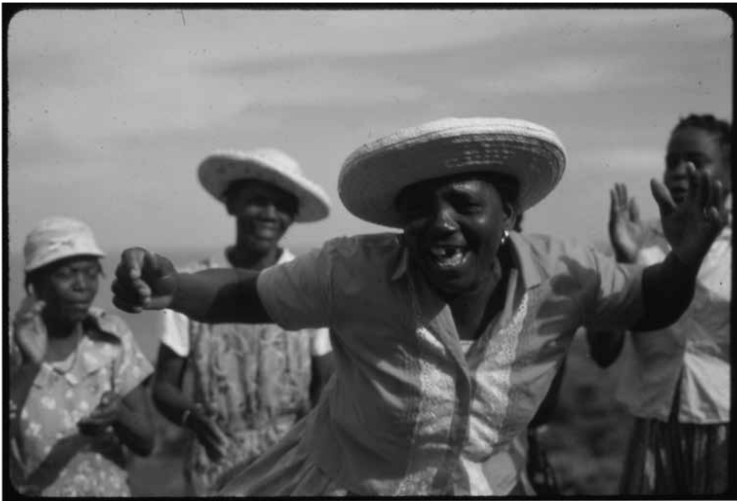
Unidentified women, La Resource, Carriacou, Grenada, August 1962.

Cultural equity should join all the other important principles of human dignity, freedom of speech, freedom of movement, freedom to work and live and enjoy yourself, and freedom for your culture to express itself. 'Cause that's all we got, you know. We're just culture.