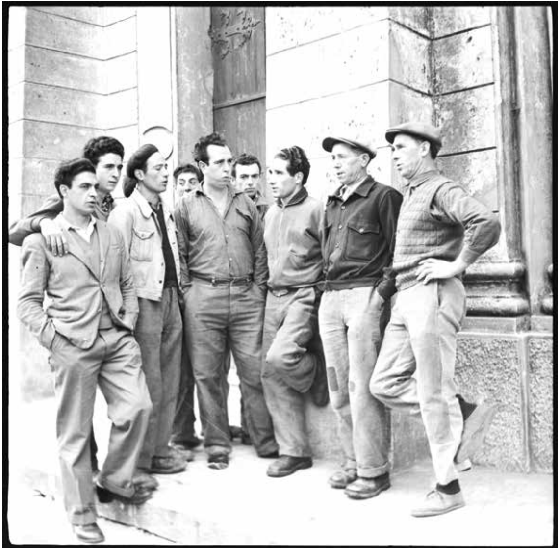
Members of the Compagna Sacco (Vol. 3), Ceriana, Liguria, Italy, October 1954.

Columbia University. The system is called Cantometrics, a word which means the measure of song or song as a measure. The measures comprising Cantometrics are those that we found, in actual practice, to sort out the main styles of the whole of human song. The rating scales of Cantometrics give a holistic overview of song performance: (a) the social organization of the performing group, including solo or leader dominance; (b) its musical organization, scoring level of vocal blend and the prominence of unison or of multi-parted tonal and rhythmic organization; (c) textual elaboration; (d) melodic elaboration in terms of length and number of segments and features of ornamentation; (e) dynamics; (f) voice qualities.