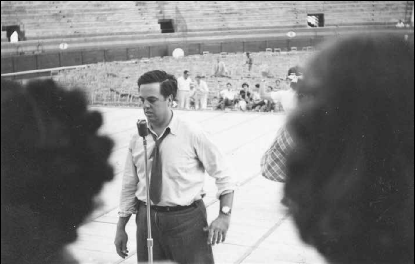
Alan Lomax at the Palma Festival, Palma de Mallorca, Spain, June 1952.